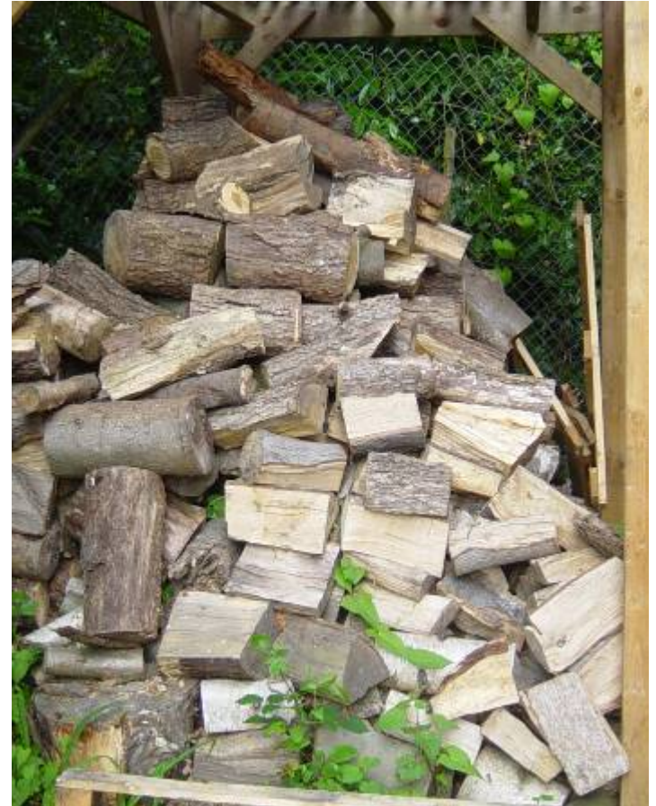
Our log pile – from local sources donated to the Parish