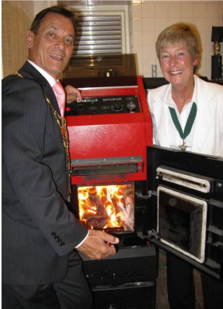
The Major launches boiler with Chair of PC